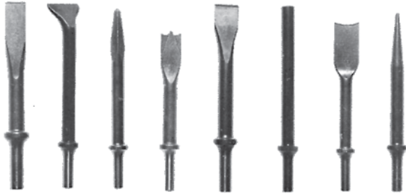
Pneumatic Moil and Chisel Point

Mindrill manufactures a wide range of high quality pneumatic breakers Moil and Chisel Points. Available in standard shank sizes to suit any brand of Pneumatic Paving Breakers.