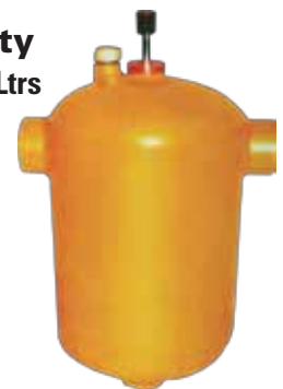
Mindrill Large Capacity Lubricators

Mindrill Large Lubricators are specially designed for heavy duty applications. Wide range is available from 2 ltrs to 30 ltrs. Its rugged and reliable design made it favorite for both drillers and managers.