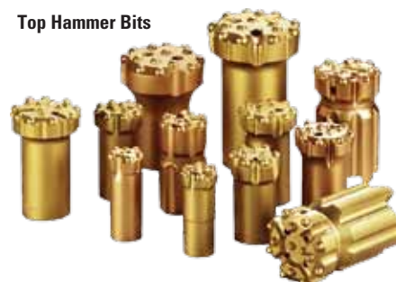
Top Hammer Bits

Button bits carbides style : hemi-spherical(round), Parabolic(semi-ballistic), Ballistic(conical).