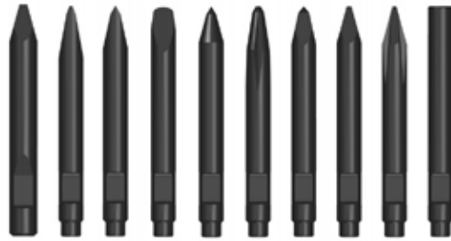
Hydraulic Moil Point

Mindrill Moil Points are tough and reliable for hard hitting hydraulic hammers. Various points' shapes and shank sizes available to suit various manufacturers' equipment and models.